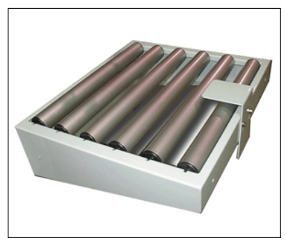
Infeed/Exit Conveyor w/ Stabilizer