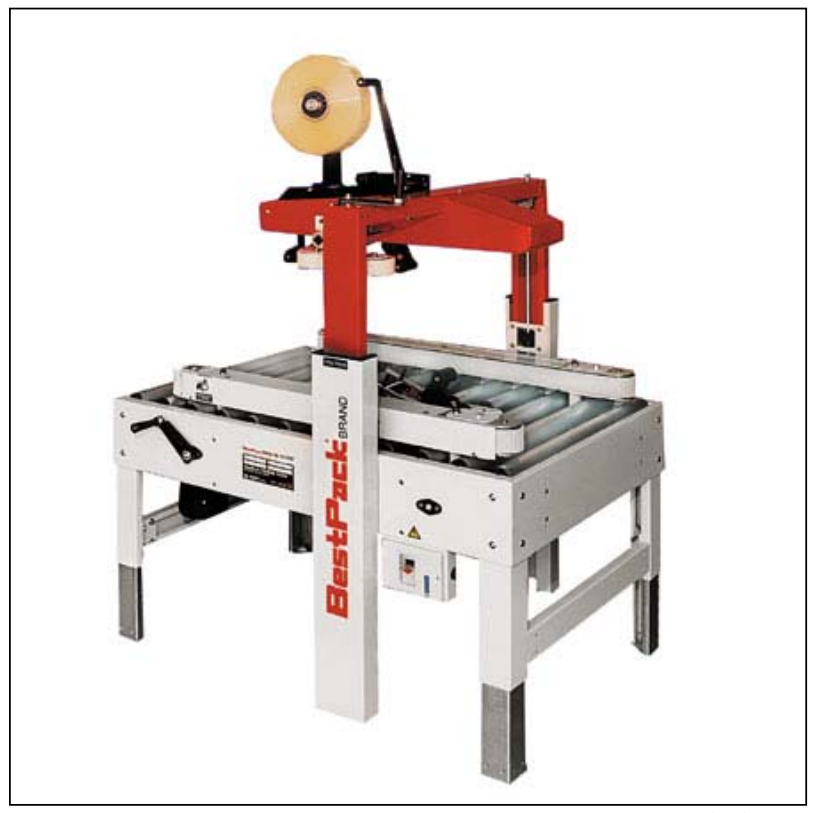
MSD22 Manual Side Drive